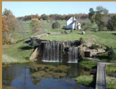
Meadows Farms Waterfall Hole

On December 11, 1862 The Battle of Fredericksburg began. This battle started on the ridge above the scenic Rappahannock River. The Union Army took up camp there in preparation for the battle. Along the banks of the river The Union Army setup cannons that gave cover fire for the troops during the battle. The fighting lasted for four days with General Lee driving out The Union for a Confederate victory.