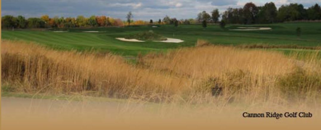
Cannon Ridge Golf Club